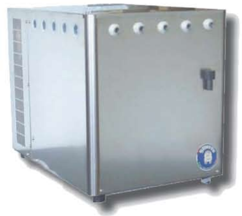
INOX 1/4 HP POT ST.STEEL 1/4 HP