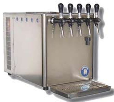
INOX 1/4 HP POT ST. STEEL 1/4 HP